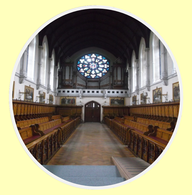
All Hallows College Chapel

Faith and prayer, self-denial leading to inner-freedom, setting beneficial example to others and presenting alternatives to individuals, particularly the young.